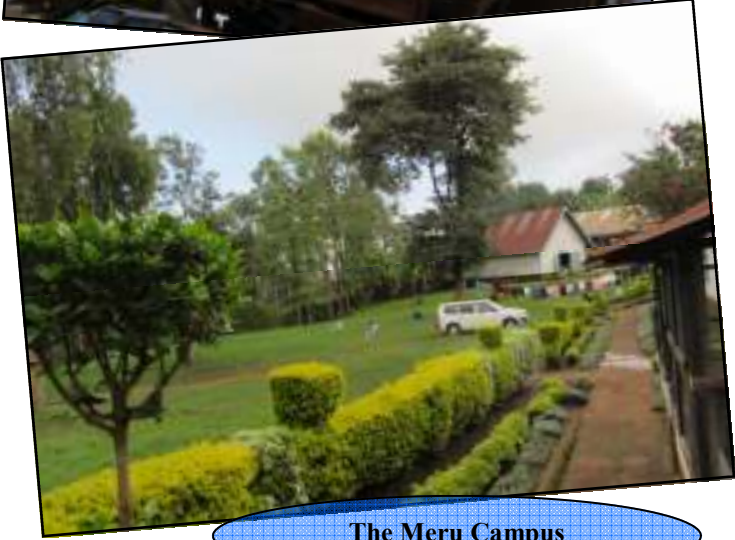
The Meru Campus