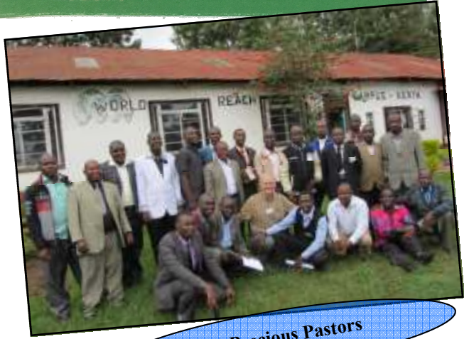
21 Precious Pastors