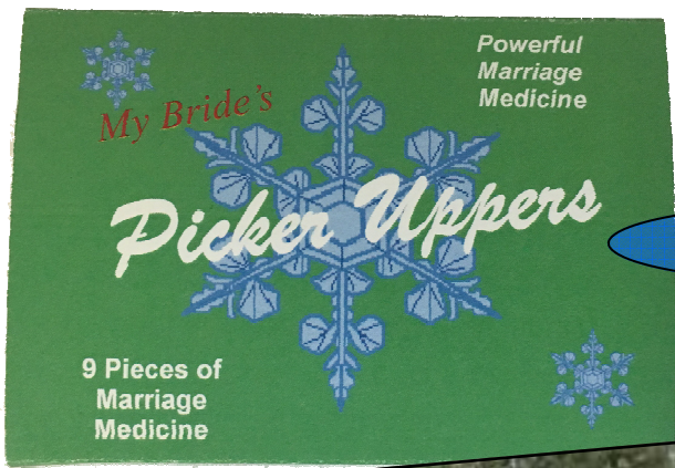
A Gift for Their Wives