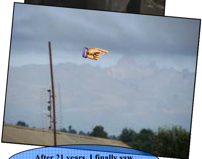
After 21 years, I finally saw the top of Mt Kenya!