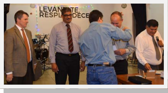
Receiving his Bible Institute Diploma