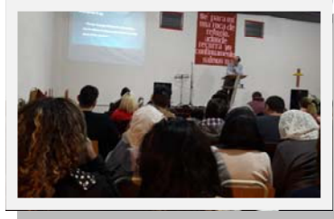
Bible Academy, Villa Maria

As far as our ministry is concerned, praise God, we are doing very well.