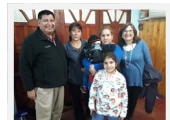
VBS 2016: Family meets Jesus