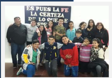
Youth from Chaco

Please pray for financial provision. We need to raise funds for the trips and for the materials we will be using.