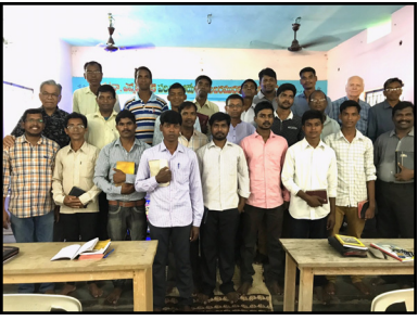
Students Hungry for the Word