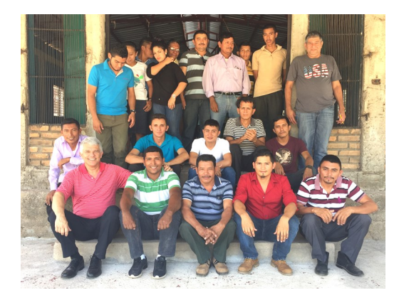
Danli, Honduras—April 23-27 - Teaching New Testament to 23 students: