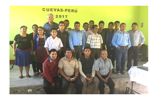
Sincerely yours in Christ,