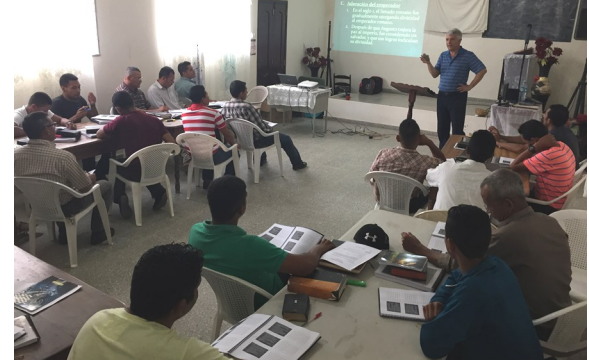
<u>Lima, Peru–May 14-25</u> - Training and Planning Conference for World Reach missionaries: