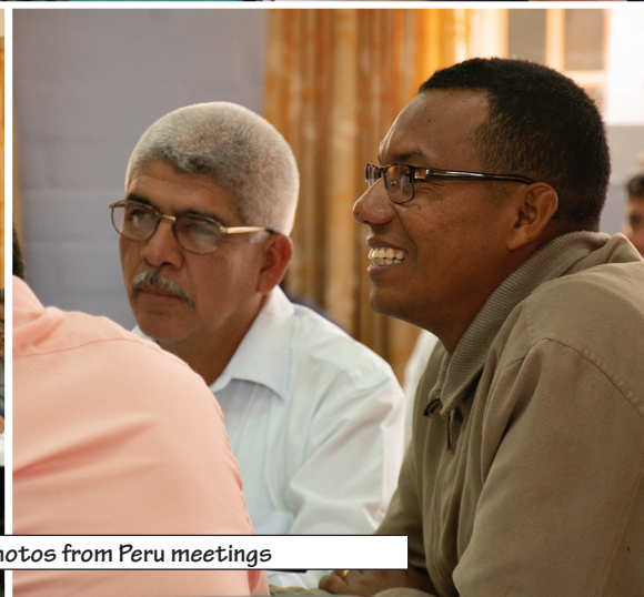
Photos from Peru meetings

Please do not underestimate your participation in the ministry in Honduras. Your prayers are an indispensable part of what God is doing in and through us here. Thank you for taking the time to understand what we are doing and to intercede on our behalf. We are grateful for your partnership with us.