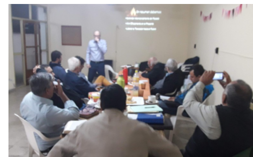
Church Revitalization Seminar

where we taught women and men separately and more specifically to each ones needs. Three women accepted JESUS as their Savior.