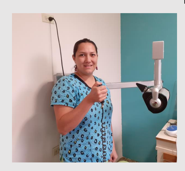
Dental X Ray