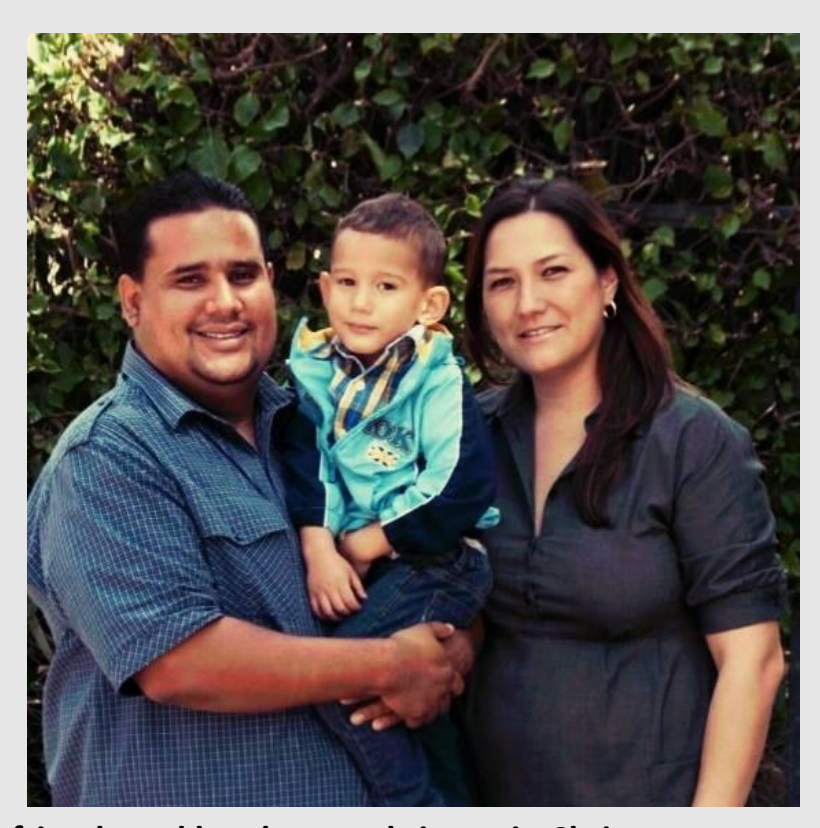
Hello dear friends and brothers and sisters in Christ:

We are happy to greet you through this letter. We want to express our profound gratitude for your generous collaboration for the Community Dental Clinic. Your offerings have allowed us to buy some equipment and materials to attend to our patients. The Community Dental Clinic serves 90 children for free from a project of our local church. In addition, free care is given to pastors and their families and missionaries and their families. The Clinic offers its services to the general public at much lower prices. We also serve rural communities through short-term medical brigades. We visit schools and churches where we serve children and adults for free. We can tell you much more about the Clinic, but we want to leave you with 3 stories, which we call: "Stories of blessing".