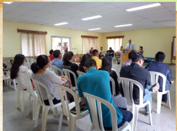
Start of classes in the Bible Seminary