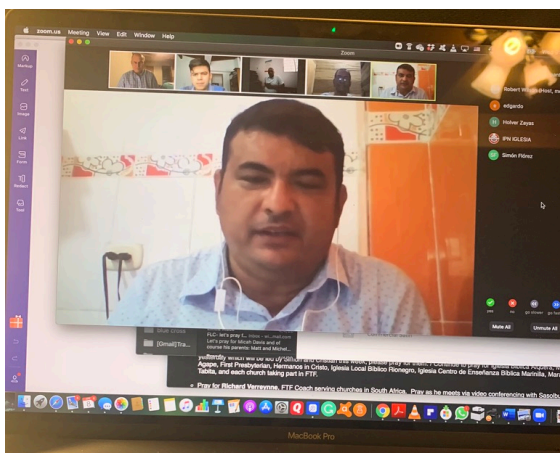
Encouraging pastors online