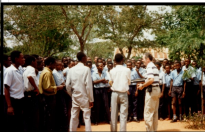
Secondary Boy's School

The school year is divided up into three terms: January - March, May - July, and September - November. The students are on "holiday" between terms. The students study nine different subjects: math, two languages- English (Kenya's official language) and Kiswahili (Kenya's national language), chemistry, biology, Christian religion, history, agriculture, and geography. With regards to language study, it is interesting that students are punished if they speak any other language.