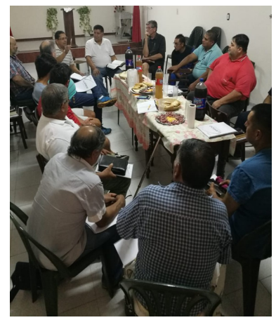
Bible studies for men