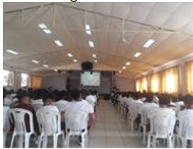
First day of school, opening with students

From 25th to 27th of March we participated in a very interesting webinar on education from biblical perspective.