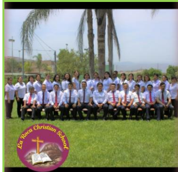
Personnel of La Roca Christian School

From 25th to 27th of March we participated in a very interesting webinar on education from biblical perspective.