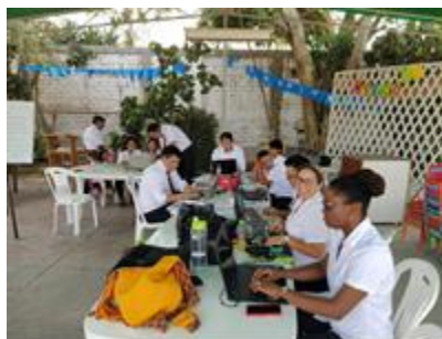
Preparations with colleagues.

On March the 5 th we continued with this workshop. The school started officially on March 6th. The parents of the students came to the opening meeting where they got to know the personnel and management of the school.