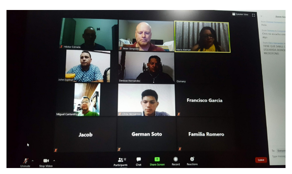
Zoom sessions in pilot program