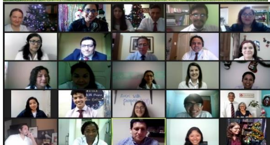
La Roca Christian School Graduations - Kindergarden, Elementary and High School December, 2020