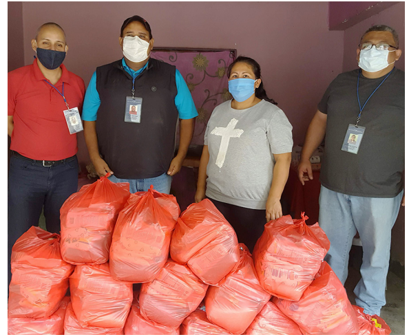
Much of the assistance was delivered by members of the local churches to maintain social distancing.

Please pray for God to work in the lives of the pastors and church leaders who will study this material.