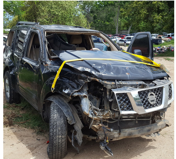
Our old car was sold for parts.

This has been quite an ordeal with some worrying and much waiting. But God has shown us his goodness once again. Please join with us in thanking him.