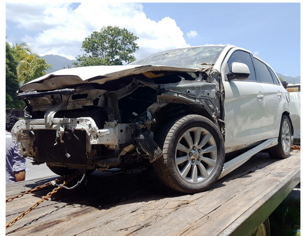
The car that is being repaired.