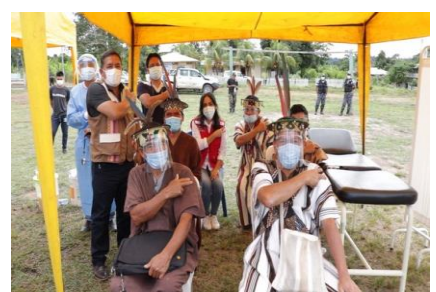
"I put my shoulder for my community"