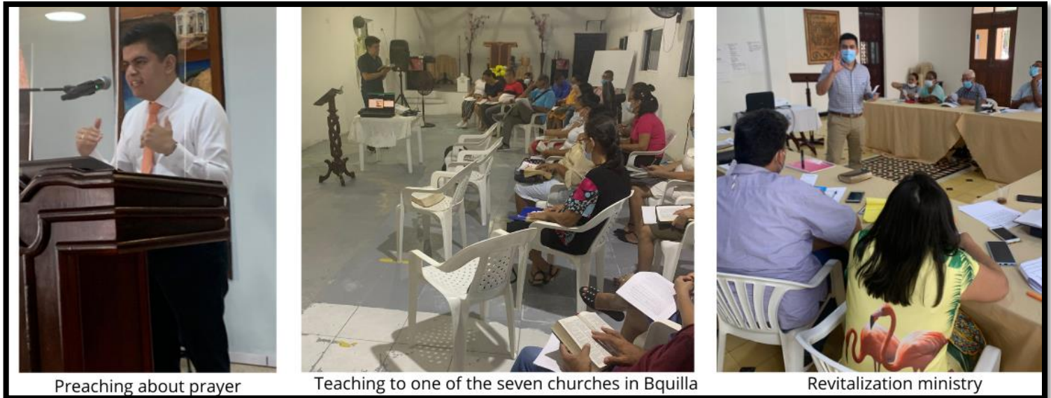
Preaching about prayer