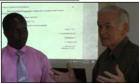
Up close teaching