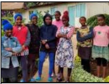
Some of the kids at our orphanage