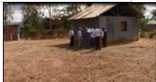
Working out a plan for the Bible Institute facilities