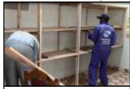
New cabinets for the boys room