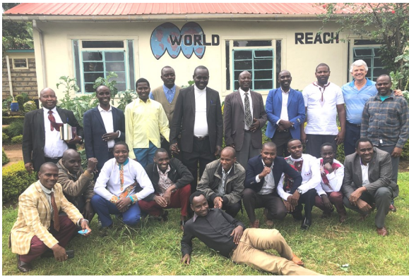
Kenyan pastors in my class in Meru