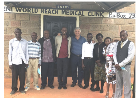
At Muthethini Clinic in Dec.