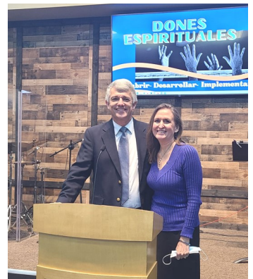
At Briarwood Hispanic Ch.

World Reach, P.O. Box 26155, Birmingham, AL 35260