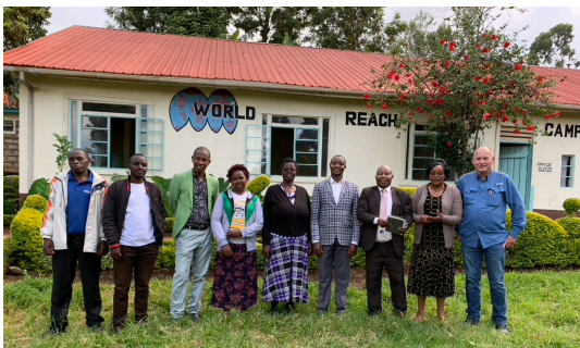
On the left our Meru team.