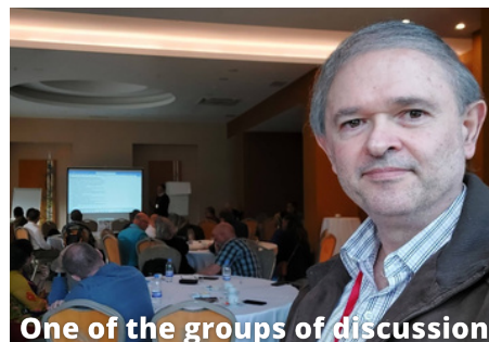
One of the groups of discussion