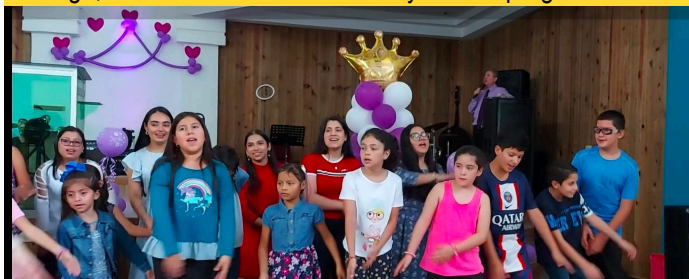
Teachers and students singing and dancing with the children of one of the Sunday School classes