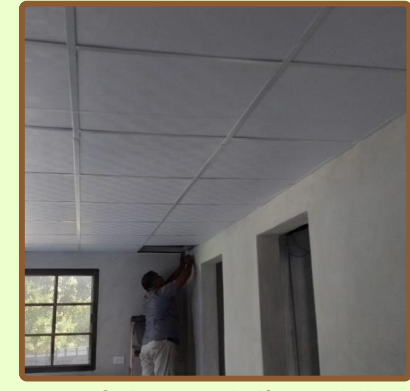
Partial remodeling of the dental clinic