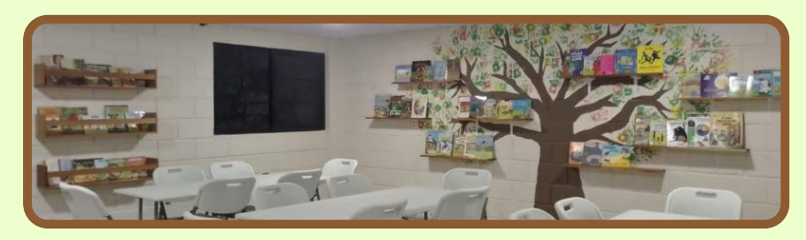
Complete Remodeling of the Learning Resource Center

Someone said that life is not about counting the days, but about making the days count. The above implies that we renounce merely existing and letting time pass in order that we might have a meaningful life, where each day becomes an opportunity to learn to see life as God sees it. In other words, the wisdom of God is present, present in everything we plan and do. It is our wish that this new year is full of the grace and favor of God in your life, that His wisdom guides us in every step. Thank you for being part of a small, special group that prays for us and financially supports our World Reach ministry in Honduras, in the heart of Central America.