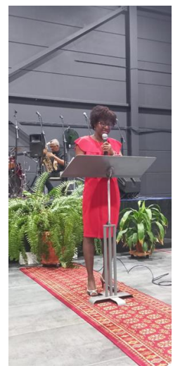
During my presentation

I thank the Lord for the support of my home church and other collaborators in the mission field here in Lima. I used this occasion of being in my country for some important matters, to share at the conference about how the Lord is working in the ministries in which I participate and those that I am responsible for here in Peru.