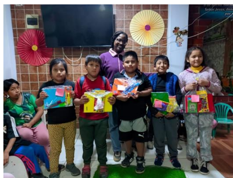
One of the groups that excelled with their prizes

On December 8 th we rewarded the children that excelled in: attendance, bringing their bibles, memorizing bible verses and bringing guests. We ended the year celebrating Christmas on December 15 th . We shared the gospel with +/- 50 children through a special movie.