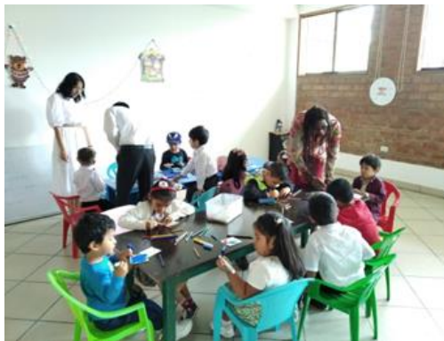
Preparing Christmas cards

On December the 24 th we celebrated Christmas with the kids in Sunday School. I shared about the Christmas story and the gospel with the little ones (3-5 years). After that we helped them with their Christmas cards. Finally, we had 'paneton' and the church offered presents to each child 😊.