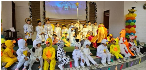
Musical of Kindergarten

We ended the school year with 2 musicals in December: on the 19 th (Kindergarten) and 21 st (the other students). After that we had graduation of Secondary school on the 22 nd .