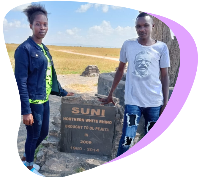
Grave of the last Northern White Rhino. Extinct due to illegal hunting.

"We had a great time learning important lessons about life from the diversity and beauty of the creation of God. We were privileged to see the African Elephant estimated to be 6000 kgs and the largest land mammal. It was a great lesson to us seeing how the male elephant protected the young ones. As fathers, we should protect those entrusted to us. From our tour guide we learned that animals also suffer from stress, and to avoid them being stressed they set aside a big portion of land whereby they move freely. A lesson learned was that we should use the freedom we have in the Lord to work and interact with others to avoid stress."