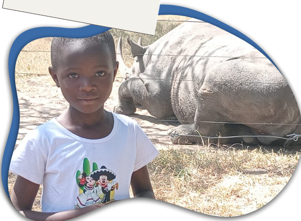
Oi Pejeta Conservancy is the largest Black Rhino sanctuary in East Africa.

"Imagine having grown as an orphan, with no love, no protection, no care, no one to take you for an outing, but all of sudden you get protection and care. This has been the story of these beautiful boys and girls. For years, some of them have found love, care, and protection in the World Reach Orphanage, but they no longer belong to an orphanage. We thank God for a trip meant to be a time of refreshing, interacting, and bonding. This trip was so fruitful. From the pictures you can see, we are having fun with the children as they now enjoy being in a home."