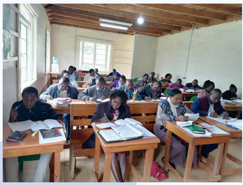
Kenya Bible Institute Class

This June, I will be headed back to the Kenya Bible Institute to teach the course on Evangelism. This is the last class the pastors are trained in before they graduate. This is my passion - to see others share their faith with confidence and to teach others also.