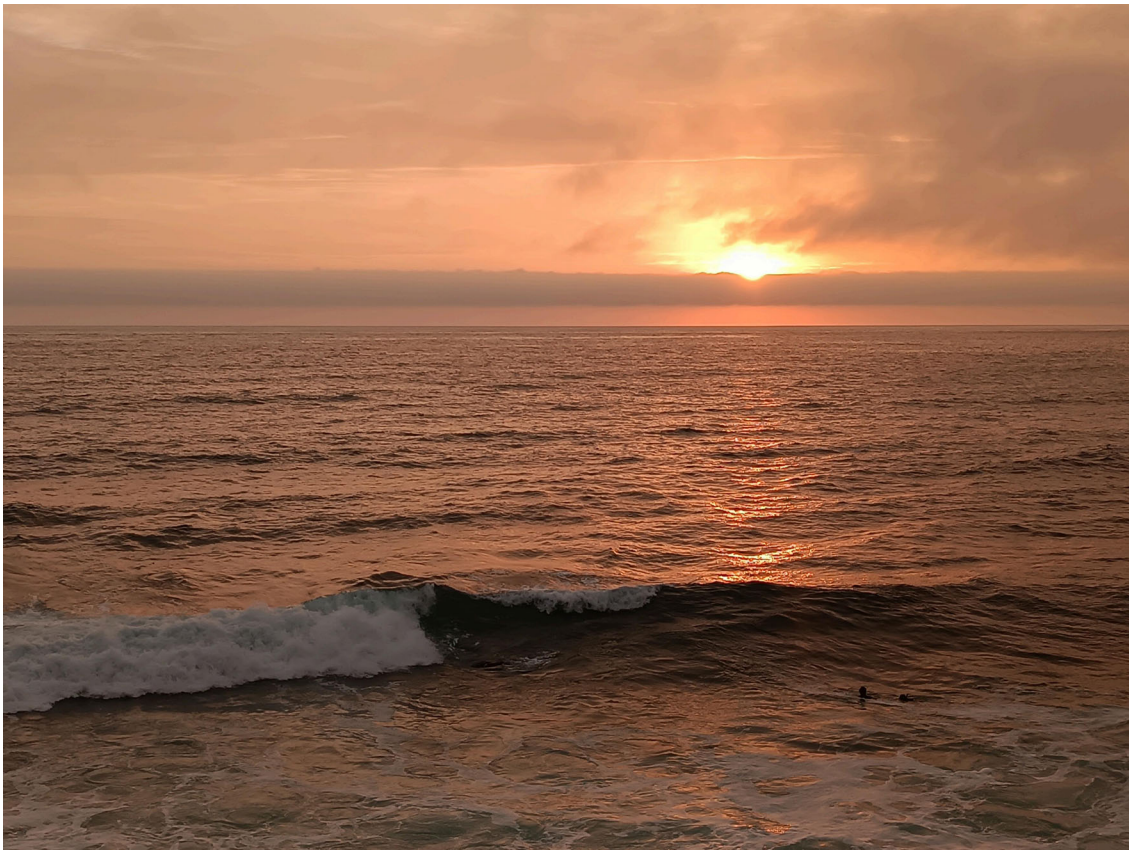
At the beach with the young adults.