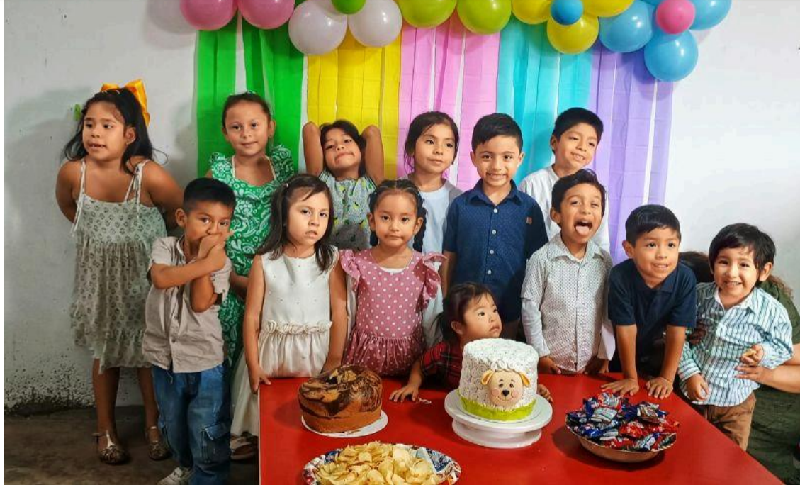
Our Resurrection Celebration