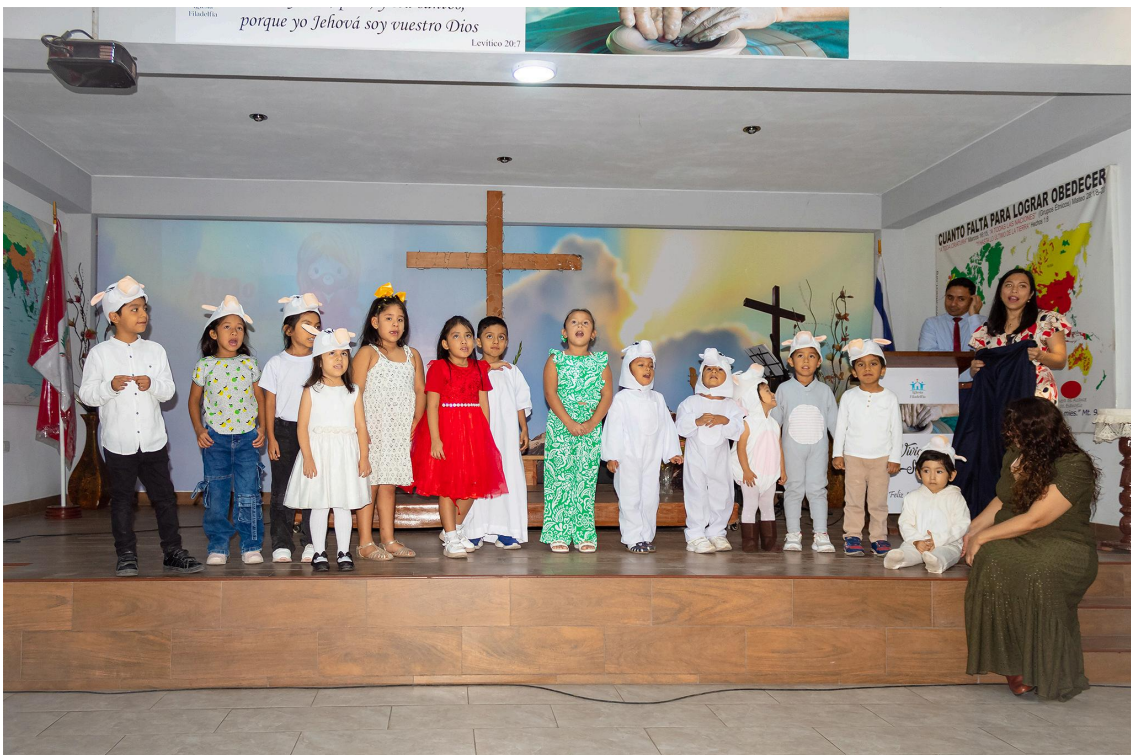
My Sunday School class singing "The Easter Lamb"