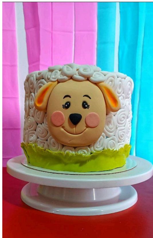
Our little "Easter Lambs"